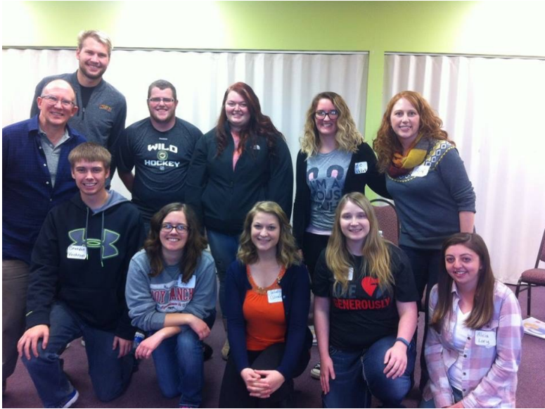
At left, top: CICS Peer Ministry team, Director and members attend Peer Ministry Training in October.