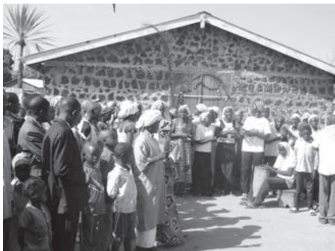
A new church roof is dedicated in Cameroon.

South Dakota Lutherans are also mission companions with the Nicaraguan Lutheran Church of Faith and Hope, which just celebrated its 25th anniversary in July. This young