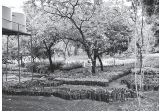
The Green Project of Cedro Galan, Nicaragua.

“Praise God from whom all blessings flow.” □